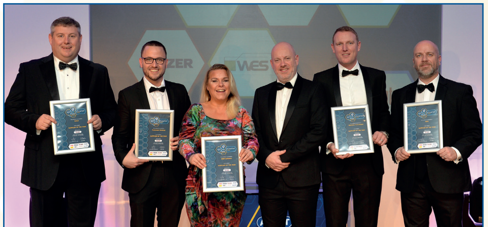
Finalists for Supplier of the Year: Sulzer, Preformed Windings, EMiR Software, Drive & Controls, Neutronic Technologies, WES