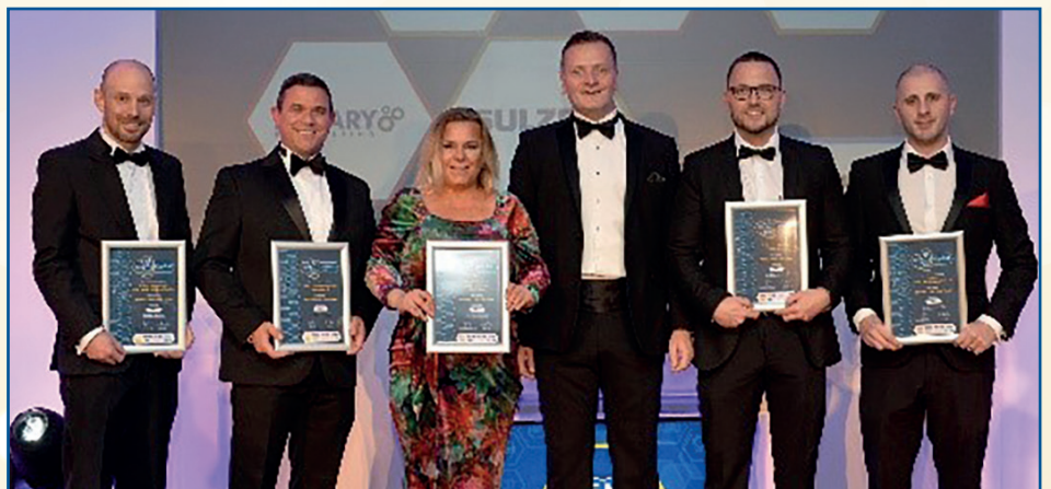
Finalists for Product of the Year: Rotary Engineering, Nidec Control Techniques, EMiR Software, P&WE, Preformed Windings & Sulzer