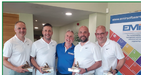
2nd Team MKE