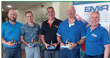
1st Team Deritend / Rubix