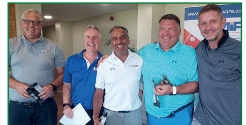
3rd Team Quartzelec